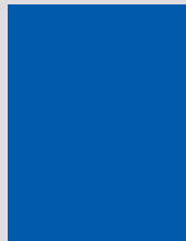
282 x 210mm Back Cover & Inside Covers Inside Pages Allow 5mm bleed on all sides