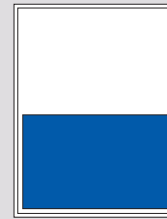
120 x 185mm Half Page (Horizontal)