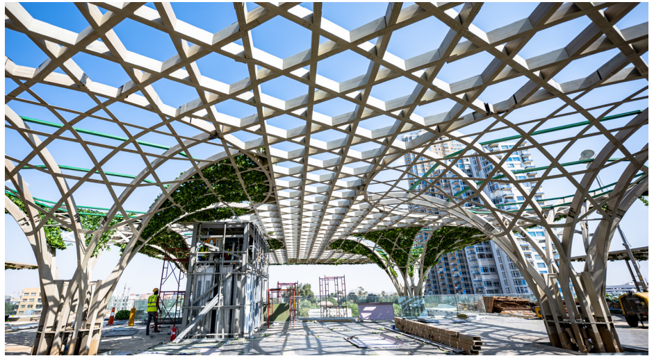
The area has been developed to provide an environment-friendly space for the city that will add lasting value to the general public.

The lagoon regeneration project was divided in two stages. The first started in May 2021, covering a land reclamation area of 20,025 sq m, while the second stage covering an area of 3,000 sq m was completed in late October. The process included the removal of algae and waste and the sub-