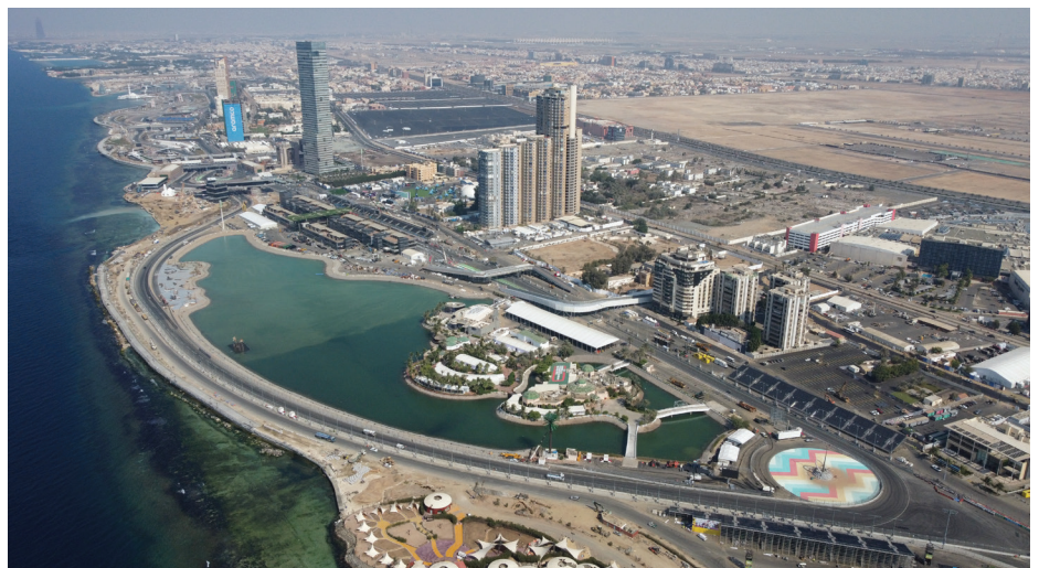
The circuit design has made strong use of the long, sweeping roads along the corniche.