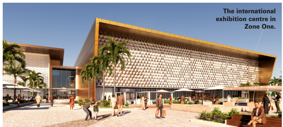
The international exhibition centre in Zone One.

Zone One is the Exhibition Circuit, which will host a stunning, 70,500-sq-m