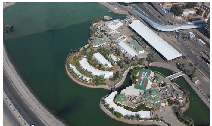
Jeddah Corniche Circuit is situated between the new marina and island mosque on a narrow stretch of land north of the city.