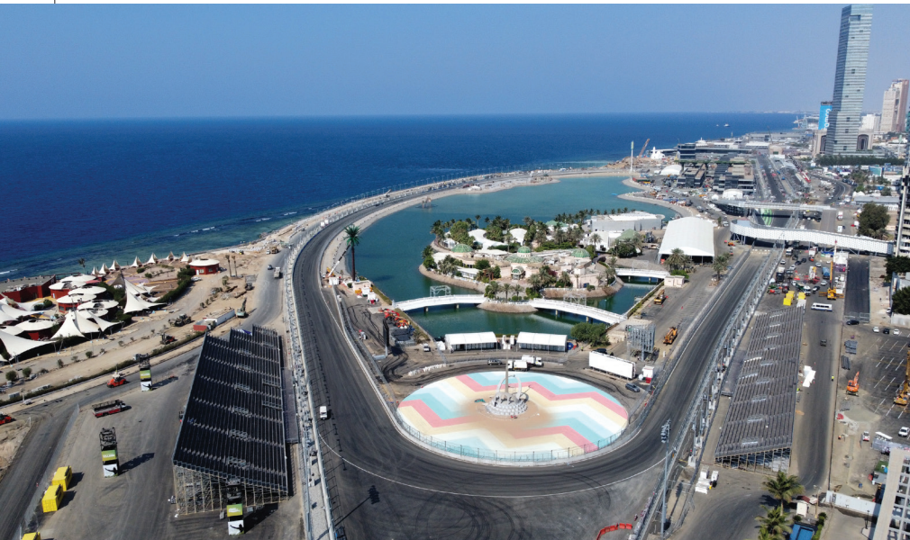
Jeddah Corniche Circuit ... a 27-turn challenge.

The world's fastest drivers are set to roar onto the streets of Jeddah for the first time on the weekend of December 3 to 5 and take on the formidable challenge of the 27-turn Jeddah Corniche Circuit. Gulf Construction looks at what the fast-track project, undertaken in record time, has entailed.