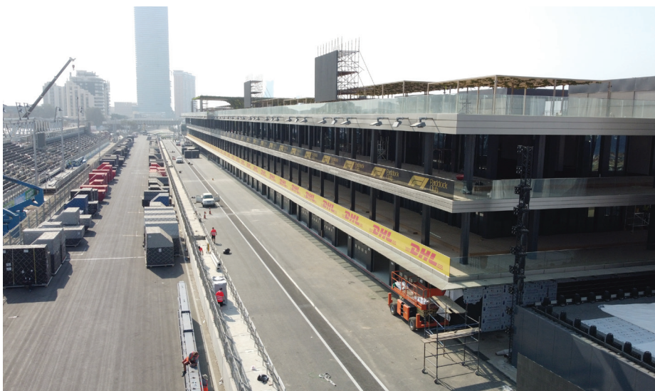
The pit lane area of Jeddah Corniche Circuit ... ready to receive F1 drivers.

Tilke provides some interesting facts on its Twitter handle: the Jeddah Corniche Circuit is the first street circuit in the Gulf region to feature LED floodlights; it is the first street circuit to feature only slot drains, which have a higher drainage capacity, on the race track. The circuit has 1,025-m of Safer (steel and foam energy reduction) barriers, the largest quantity installed on an F1 circuit. It is the first time such barriers have been installed in the Middle East. ■