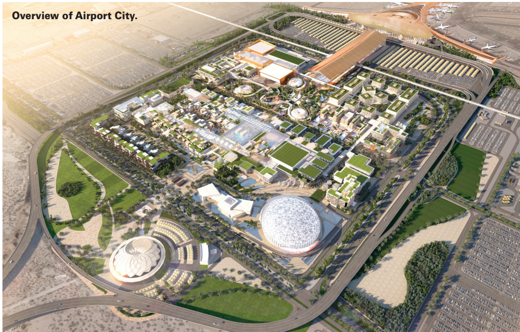
Overview of Airport City.

Finally, Zone Four will be the setting for a 'Calm Community' containing duplexes and apartments within the quietest area of the site, all sitting above a ground floor level which includes amenities such as laun-