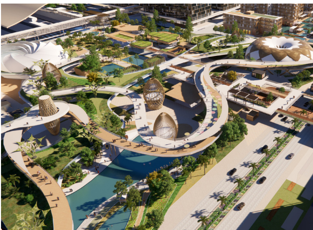
The central park in Zone One.

"The Airport City's vision is to capture broad opportunities in tourism and business while also providing a dynamic lifestyle and family entertainment hub," he says. ■