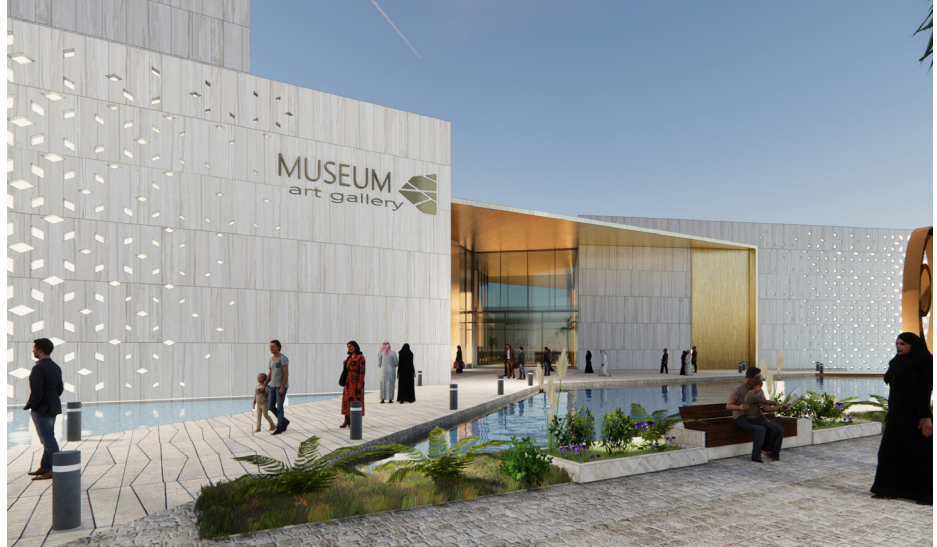
The Museum of Saudi Art and Culture ... a landmark feature in Zone 4.

mise or eliminate any negative environmental impacts through skilful, sensitive design, efficiency and the responsible use of materials, energy, development space and the ecosystem at large.