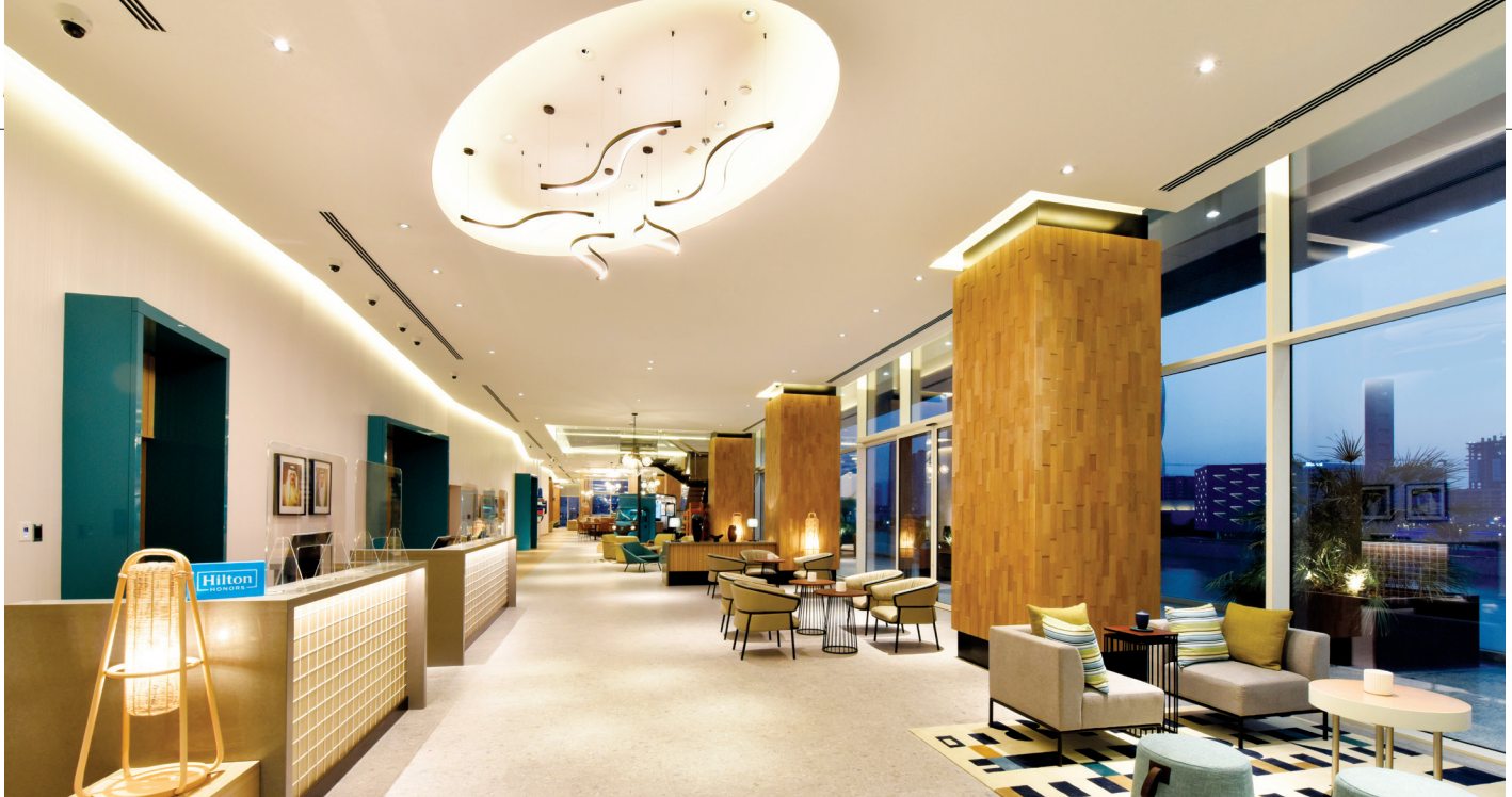
Hilton Garden Inn ... adjacent to The Avenues mall in Bahrain.