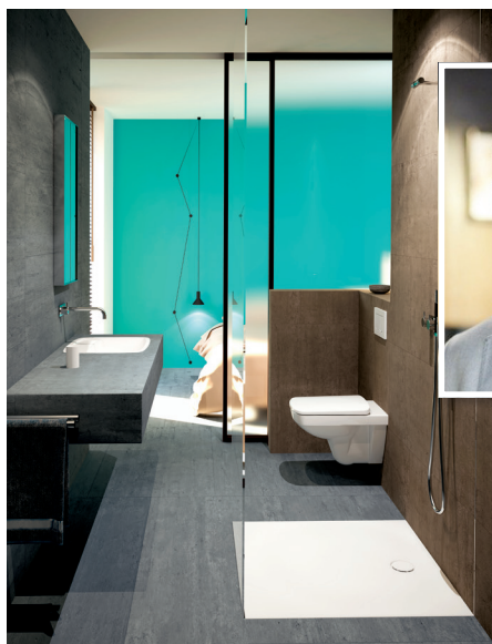
Hotel bathrooms should have a timeless design and modern sanitary technology.

If the bathrooms are still equipped with exposed cisterns, these can be replaced by