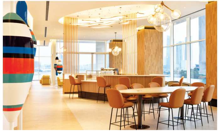
Havelock One's factory manufactured ceiling panels, reception counters, banquet seating, tables, countertops and doors.

niscent of the city's past, reflective of the present, and representative of its future as a growing, dynamic and cultural hub, it says.