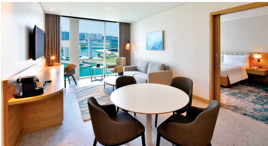
A guest room at Hilton Garden Inn ... millworks by Havelock One.

The design of this luxury hotel is remi-