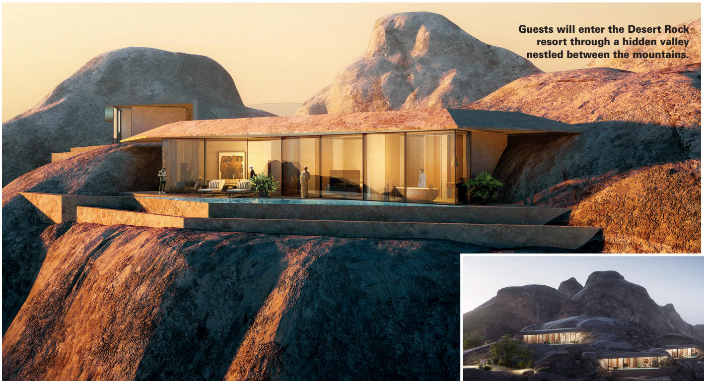
Guests will enter the Desert Rock resort through a hidden valley nestled between the mountains.