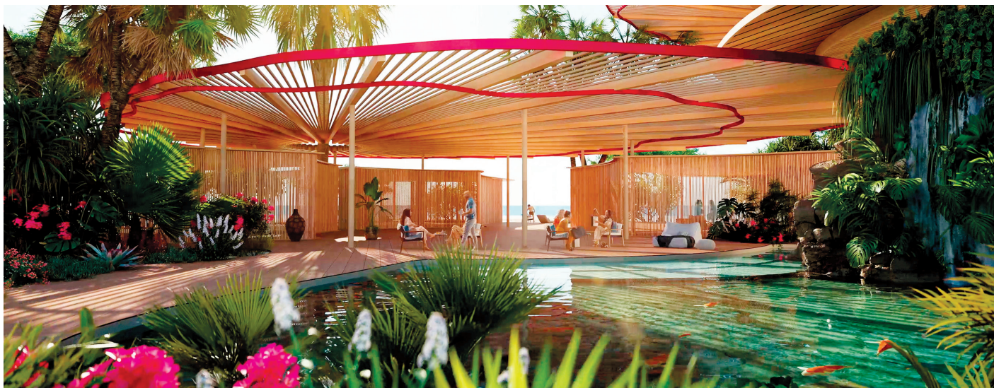
Coral Bloom hotels are designed to give the impression that they have washed up on the beaches.

"TRSDC and our partners are investigating in the most innovative and sustainable approaches to delivering this ground-breaking resort, which is elevated