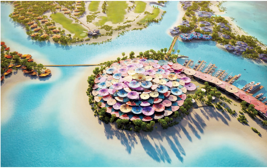
Coral Bloom will comprise 11 hotels on Shurayrah island.

175-m-plus above sea level with dramatic topography, and villa elevations vary from 180-m-plus to 280-m-plus above sea level,” says Williamson.