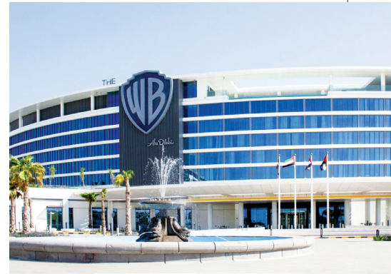
WB Abu Dhabi ... now complete.

pool in cabanas and sunbeds, The Matinee provides a casual dining option, while The Director's Club offers an elegant dining experience and The Overlook lounge provides 360-degree view of the city, adjacent Warner Bros theme park and sea views. ■