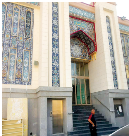
Matam Charity project ... featuring customised Escon Express lifts.