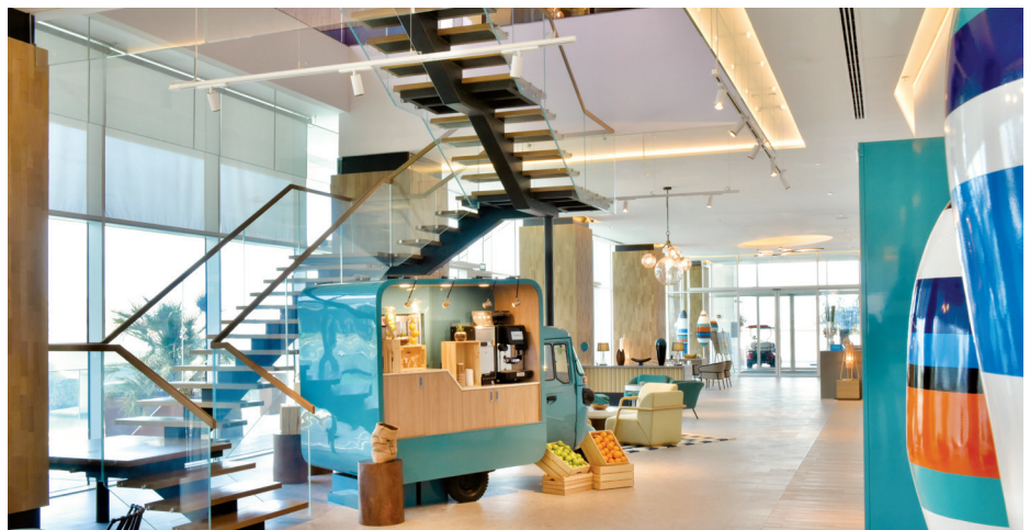
The rickshaw (tuk-tuk) food truck located in the Together & Co Lobby Café.

Since its inception in 1998, Havelock One has established itself as a leading turnkey fit-out service provider in the GCC, specialising in interior contracting and the manufacturing of bespoke joinery, metal works and elaborate shop-fittings. The company supports its sophisticated client base with high-end services and products for hospitality, F&B, retail, commercial, government, entertainment and residential projects. ■