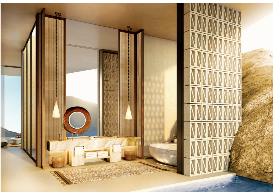
The 60-key Desert Rock will be built into the stunning Saudi mountain landscape.

Some 50 resorts that offer memorable experiences are expected to come up at The Red Sea Project in Saudi Arabia. A look at two key concepts that have been unveiled for this unique destination.