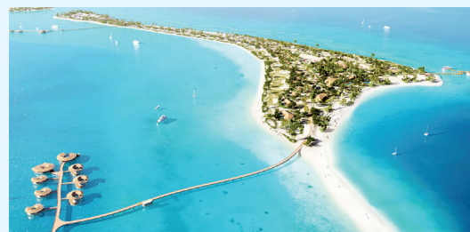
The St Regis hotel to come up at the project.

"We are proud to unveil our collection of